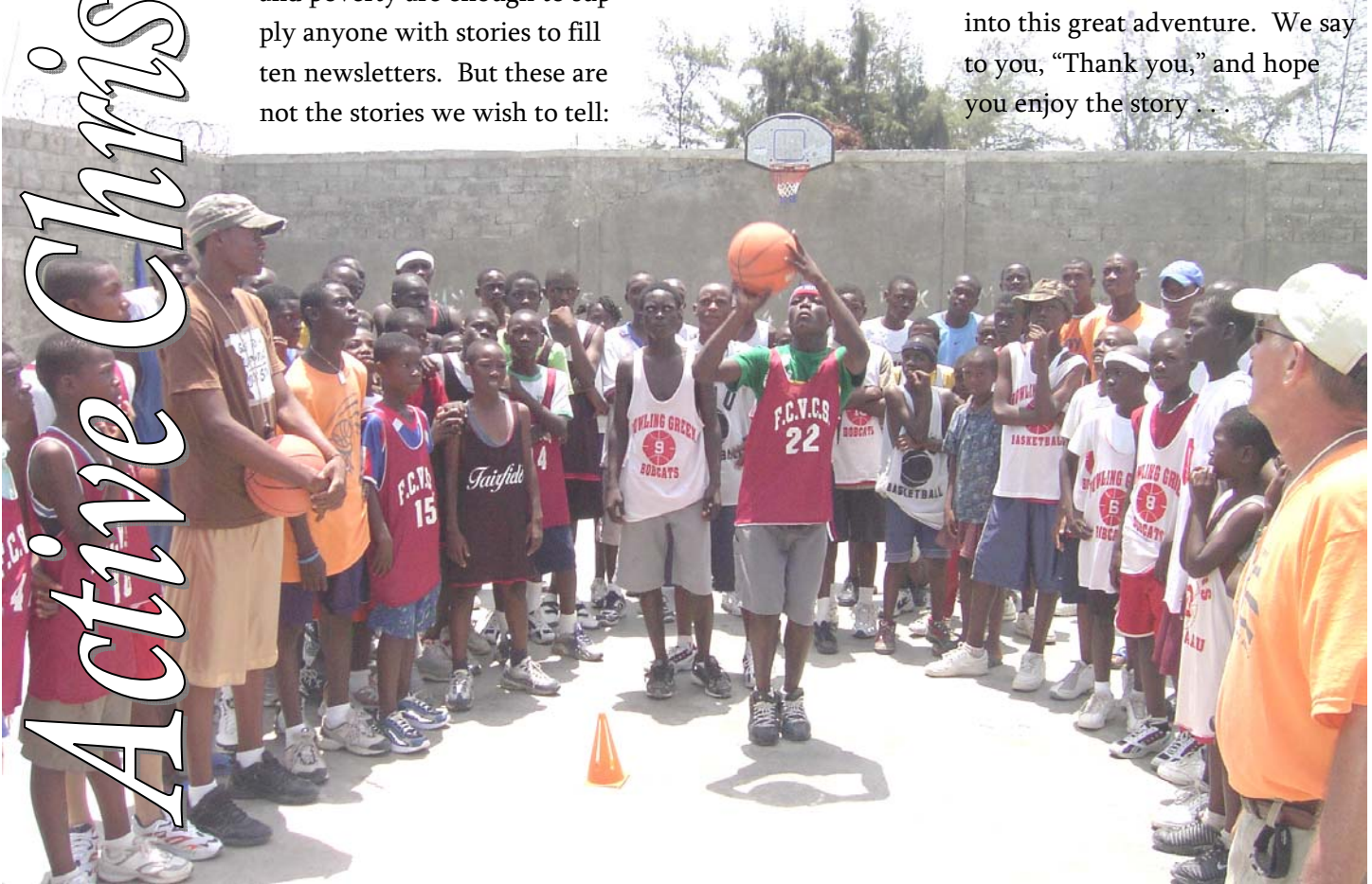
Haitian teens look on eagerly as free-throws determine who will advance to the finals. Our annual basketball camp has become an anticipated event in the community of Port de Paix, Haiti.

adventure of a lifetime, a story about how simple acts of love and sacrifice are paving the road for God’s kingdom to advance in a dark and dying world. Thanks to the regular support and prayers we receive, A.C.T. is able to continue to invite college students into this great adventure. We say to you, “Thank you,” and hope you enjoy the story . . .